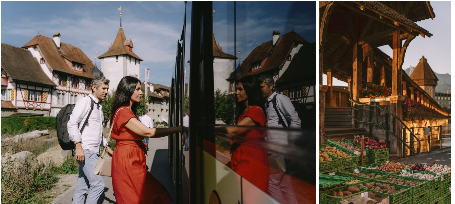
Caption from left to right.: Travelling by bus in the Lucerne-Lake Lucerne Region, weekly market in Lucerne