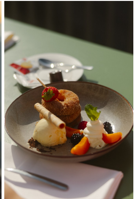
Caption from left to right.: Enjoying the sunset on Mt. Pilatus, dessert at Resturant Pilatus Kulm